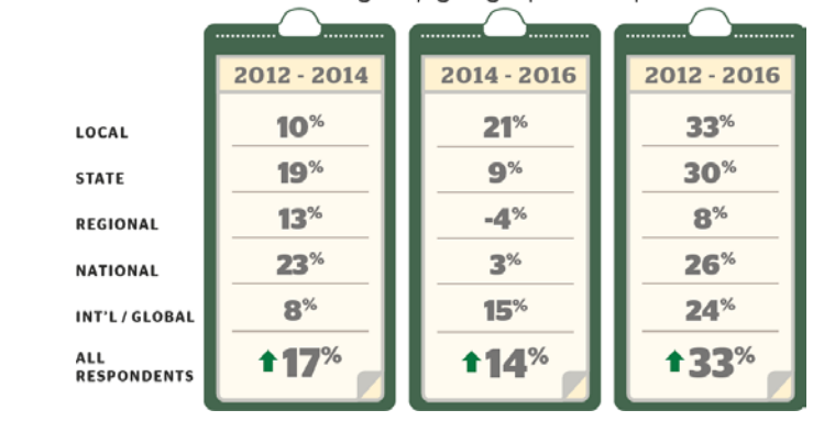
Table 5 Percent change by geographic scope

Given the large variety of industries served by associations and the small differing groups of respondents from each industry each survey year, it is challenging to draw conclusions from the data about the impact of industry on the association CEO salary. However, an examination of the median base salary for CEOs in industries for which ASAE has data from 2012 to 2016 reveals that respondents from certain industries have fared better than others when they are compared to the overall median CEO base salary. Median CEO base