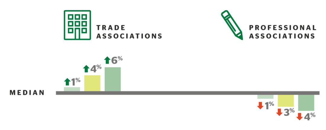
Figure 1 Difference from median CEO base salary by association type